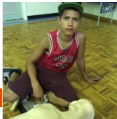
First Aid Training

In 2014 two students completed the White Card qualification, enabling them to work in the construction industry anywhere in Australia