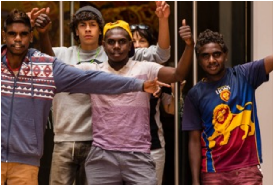
Future Board Members at the 'Strong Leaders, Strong Futures Program